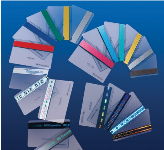
Figure 2 DIC magnetic tapes come in five standard colors and six sparkling colors.

Having supplied the financial sector globally with high-quality magnetic tape for over 40 years, DIC offers a wide range of magnetic tape options which are aesthetically attractive, durable and reliable.