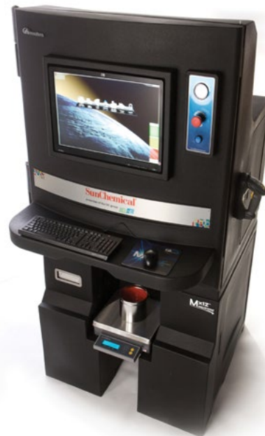
Figure 1 The GFI MX 12 dispensing unit from the Sun Chemical Dispenser Program.

Users of the Sun Chemical Dispenser Program have the ability to mix spot colors much more accurately and reduce operation costs—a win-win for brand owners and printers alike.