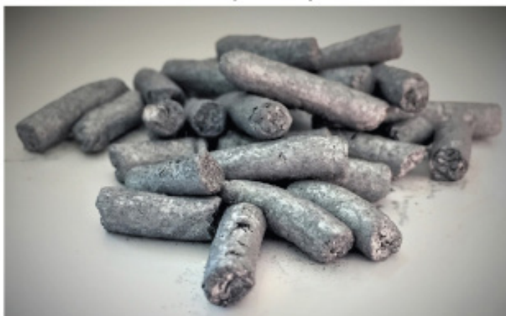
FIGURE 1—Pelletized aluminum used as the subject of this study.

In the following examples, the pelletized aluminum pigments are made using a fine, leafing corn flake pigment with a d50 particle size distribution of 9 \mu m. They are composed of approximately 85% aluminum flake and 15% of a polyester resin. The pellets are dry and approximately 5 mm in diameter, as seen in Figure 1 .