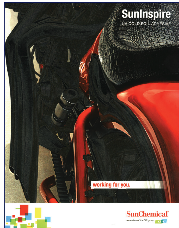
Figure 3 SunInspire Cold Foil Adhesive Coatings

SunInspire Cold Foil Adhesive (Figure 3) is another special-effect coating that can help products pop off the shelf. Designed for flexographic or litho applications, the coating system allows for simpler foil stamping; can be used on paper, paperboard and various plastic substrates; and yields economical replacements for metalized and holographic substrates.