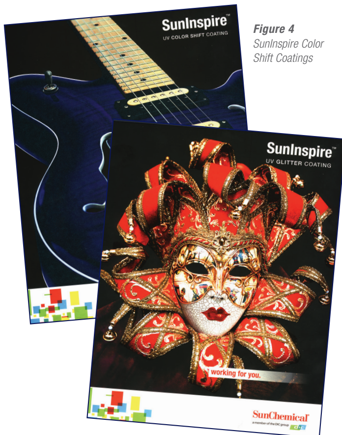
Figure 4 SunInspire Color Shift Coatings

Another visual effect Sun Chemical offers is SunInspire Glitter coatings (Figure 5), which incorporate small holographic bits of glitter. Best applied with a roll coater, the effect from this coating is most pronounced over dark colors.