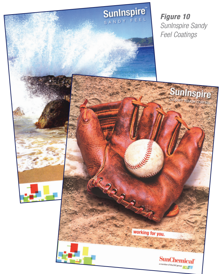
Figure 10 SunInspire Sandy Feel Coatings

Designed for a wide variety of substrates, SunInspire Soft Touch (Figure 11) coatings create a matte surface that has a soft feel.