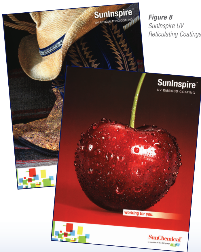
Figure 9 SunInspire Emboss Coatings

For example, using the SunInspire UV Reticulating coating varies the finished dried films from a smooth dull appearance into a reticulated texture effect (such as a wrinkled “alligator” hide) (Figure 8). These effects are spot printed and flood coated with a SunCure UV coating.