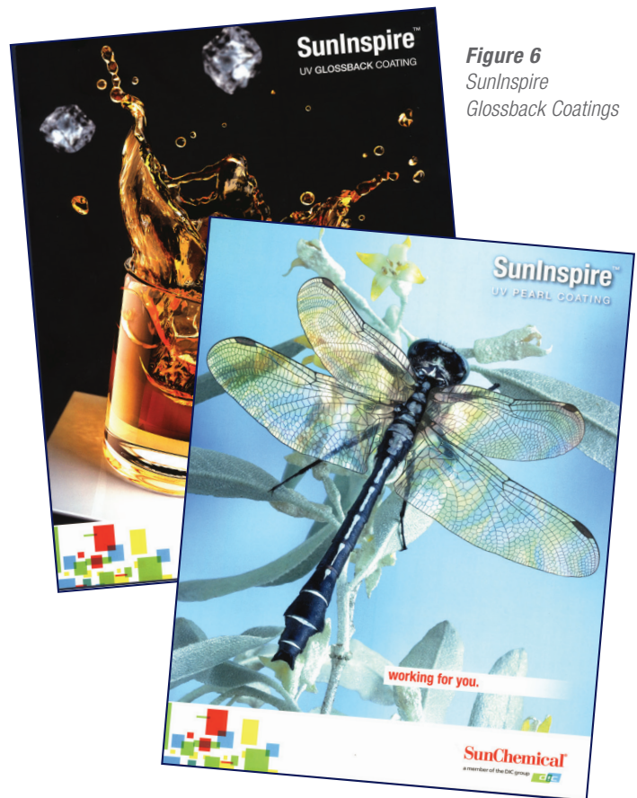
Figure 6 SunInspire Glossback Coatings

Similar to the pearlescent effects coatings are the iridescent coatings, which are rather flat and weakly colored when viewed at one angle, but take on the metallic sheen of another color when the viewing angle is changed. While not the best choice for small detailed work, this effect can be used to simulate metallic effects, depending on the thickness of the coating used.