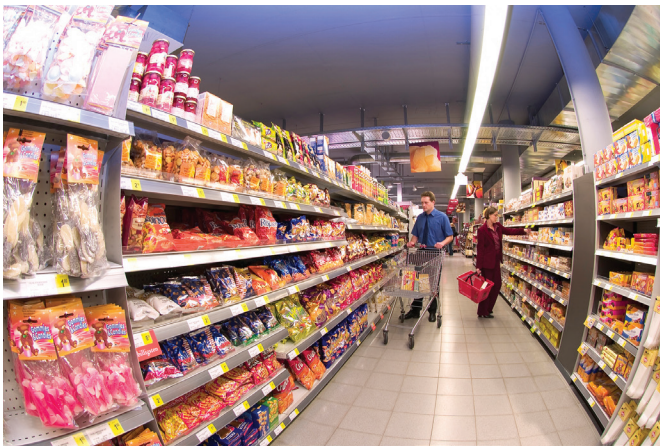
Figure 1 Packaging on the store aisle has three to seven seconds to make an impression. If the package doesn't stand out in a sea of glossy packages, impulse purchases won't happen.

Sun Chemical's SunInspire™ Coatings Engage the Senses to Grab Attention of Shoppers